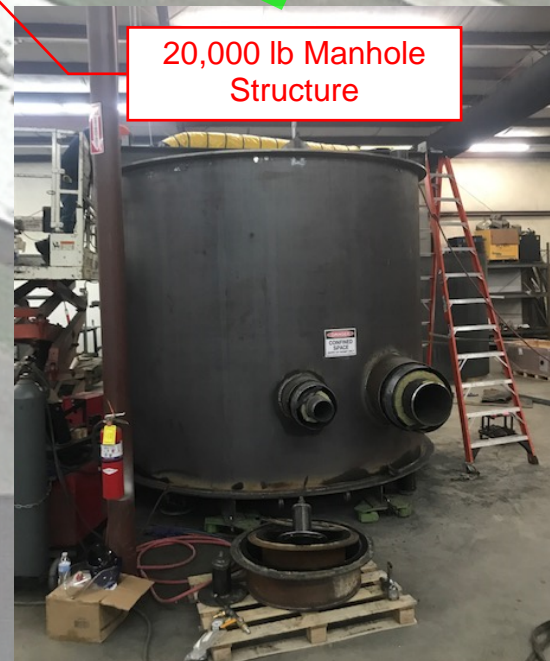
20,000 lb Manhole Structure

Emergency vehicle access to the following campus areas: Power Plant, Dickenson Hall, Catherine Dower Center, Conlin, Seymour, and Welch halls.